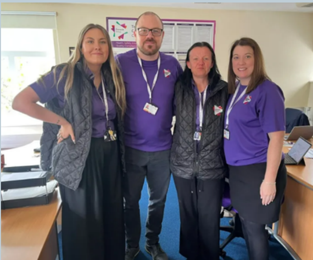
Housing Officers from the Colchester team modelling their new uniforms.

Housing Officers are the local contact point for you and your family, providing support to you and the wider community.