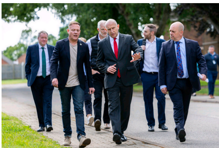
Defence Secretary John Healey (front middle) on a tour of newly refurbished accommodation.